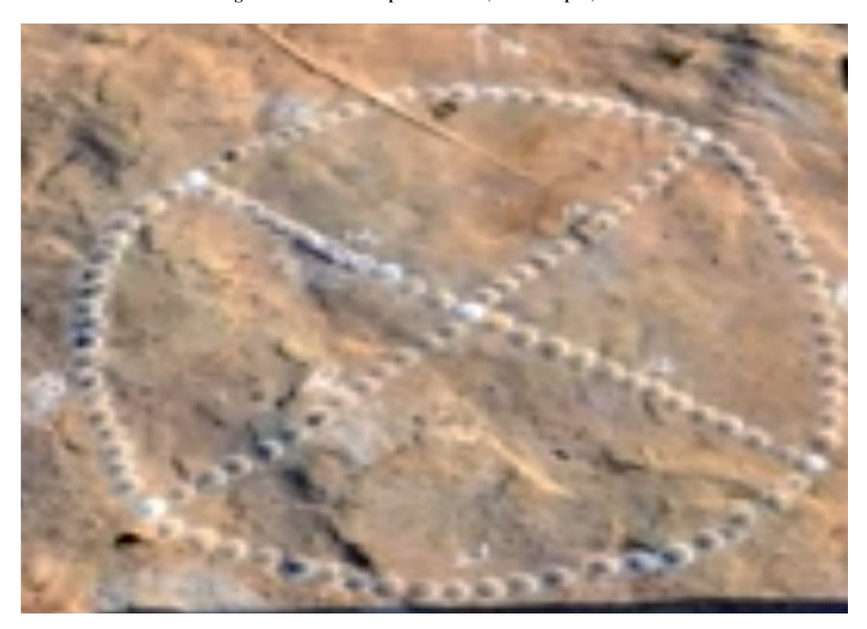
Fig. 3: Nyout (Circle and Cross) Game at Erva-Jhari, Chandrapur, India

cross & circle or cup-marks, but are the remains of an ancient board game which is totally vanished in India. In ancient India the name of this board is completely disappeared but this board game is still played in some of the south- eastern countries by various names "Yut-Nori/Yannori or Nyout". To welcome the New Year at the time of harvesting this board game has been played.