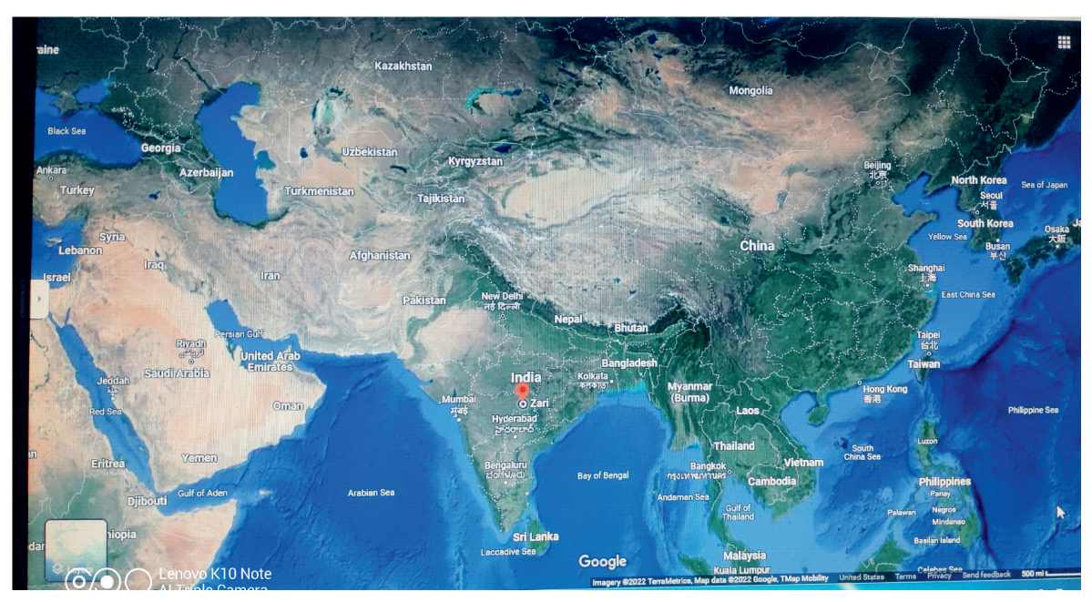
Fig. 2: Location of Map Erva-Jhari, Chandrapur, India